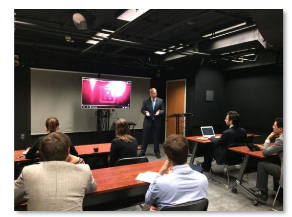
Focused media training for 12 young French conservatives

Trainings can be held as standalone events, or integrated as part of an existing conference agenda.